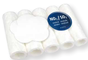
Spare parts package gas preparation

5 x infiltec filter PVDF 5 x teflon membrane