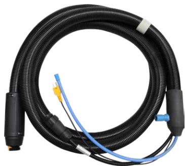
Heated sampling line for interchangeable probes with termocouple, draft and gas connector