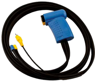
Base handle for interchangeable probes with termocouple, draft and gas connector