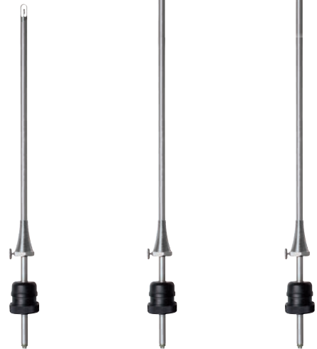
Interchangeable probes AWS-S, Ø 8mm